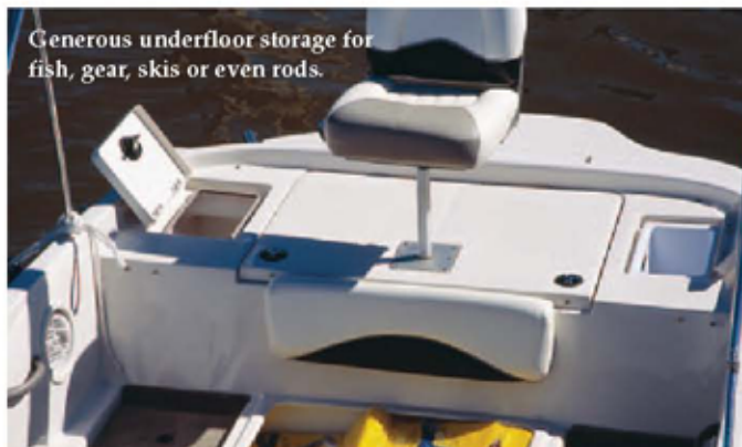
Generous underfloor storage for fish, gear, skis or even rods.