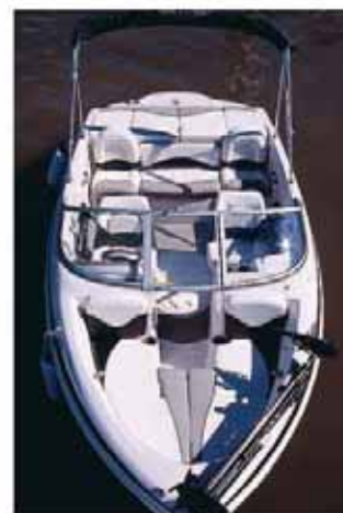
The boat in family or ski mode. The seats are relocated in travelling position and cushions