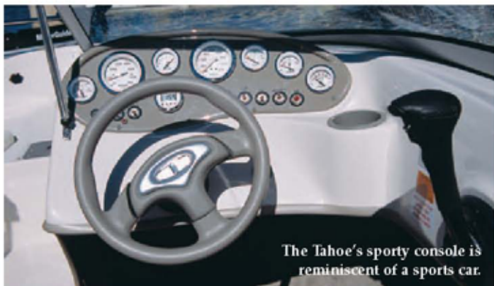
The Tahoe's sporty console is reminiscent of a sports car.