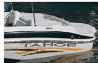
Rear deck, storage compartments and live bait wells.