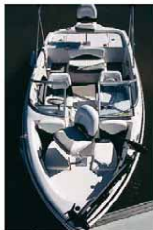
The boat in fishing mode with cushions removed and seats relocated into forward and rear

The conversion from ski to fish only really takes a few minutes, the cushions are simply removed from the front and rear decks converting them to neat, solid casting platforms. The two rear seats are removed and relocated on their posts in position on the platforms to allow them to be converted to fishing and casting seats.