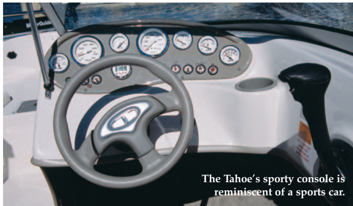
The Tahoe's sporty console is reminiscent of a sports car.