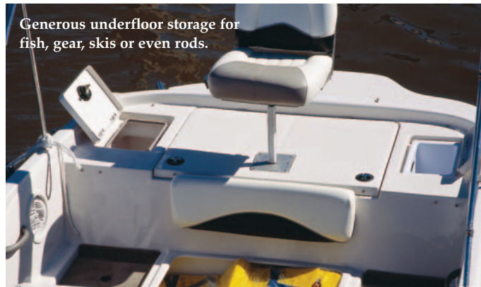
Generous underfloor storage for fish, gear, skis or even rods.