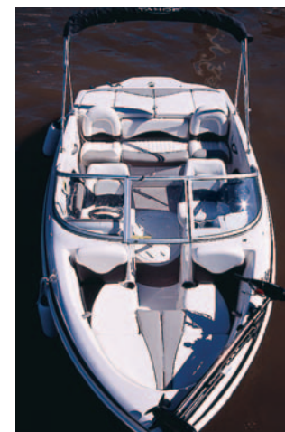
The boat in family or ski mode. The seats are relocated in travelling position and cushions are laid in.