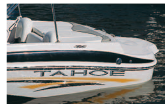
Rear deck, storage compartments and live bait wells.