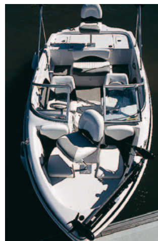
The boat in fishing mode with cushions removed and seats relocated into forward and rear casting positions.

The interior is well designed and laid out and fishing is never an after thought. As part of the Tracker Marine Group, one would expect just that and Tahoe models,