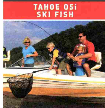
TAHOE Q5I SKI FISH

For ski buffs, there is a wide center-line locker that's just deep enough to store your slashing weapon of choice. Those who are into skiing more than fishing might opt for one of several wakeboard tower options, but this would prevent the angler on the stern from casting rearward with any distance. The standard ski tow is located at the top of the transom and will get the job done, but a good compromise would be a pylon where the rear fishing seat inserts, but it would need reinforcement.